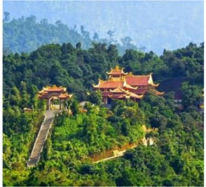
Truc Lam Monastery

Then visiting Da Lat Flower Garden (formed in 1966) is known as the paradise of flowers with a rich collection of local and foreign flower types: roses, impatiens walleriana, chives, azaleas, bird of paradise, hydrangeas, orchids, cactus.... . Afternoon visit King Bao Dai's Palace , Dalanta Waterfall and take the cable car to Truc Lam Monastery – One of the Buddhism Central of Vietnam.