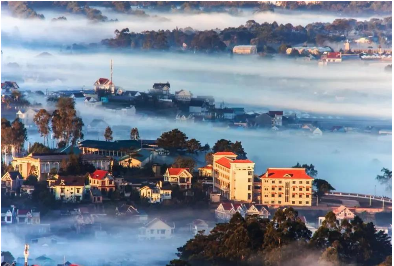
The overview of Da Lat

Upon arrival at Lien Khuong Airport, meet by our representative and transfer to Dalat centre. Check in hotel. Free to go shopping at .